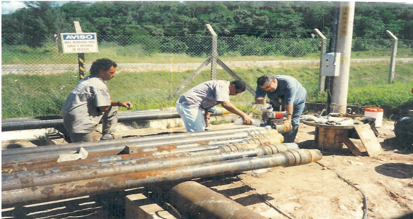
Field Installation of RFID tag for Petrobras in 1998