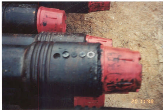
Tag Installation sequence

Once all RFID installations have been completed, scan and record required data for each item and download the data into the database being used to begin the tracking/identification processes.